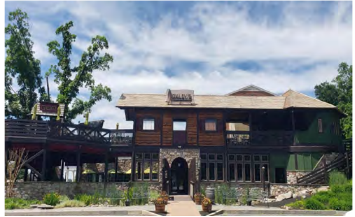
Best Western PLUS Executive Hotel Richmond

Located in the Pennsylvania Dutch Country, this hotel features a seasonal outdoor pool, a fitness center, and a restaurant with a patio and deck. The Heritage Hotel Lancaster offers rooms equipped with free cable TV, a refrigerator, a microwave, coffee-making facilities, a hair dryer, a work desk, and comfortable seating. Select rooms include an overstuffed armchair and ottoman. The Heritage Hotel's two-story patio restaurant, Loxley's, serves meals from breakfast until late evening and features a full bar. Facilities at the Heritage Hotel Lancaster include a business center. Free Wi-Fi is available throughout the hotel. Guests can also enjoy a pool deck and a fitness center. The Heritage Hotel Lancaster is easily accessible from the highway and is located next to the Dutch Apple Dinner Theatre.