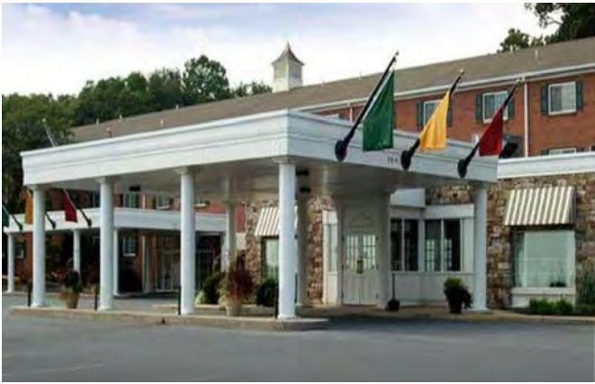
Heritage Hotel Lancaster

Located in the Pennsylvania Dutch Country, this hotel features a seasonal outdoor pool, a fitness center, and a restaurant with a patio and deck. The Heritage Hotel Lancaster offers rooms equipped with free cable TV, a refrigerator, a microwave, coffee-making facilities, a hair dryer, a work desk, and comfortable seating. Select rooms include an overstuffed armchair and ottoman. The Heritage Hotel's two-story patio restaurant, Loxley's, serves meals from breakfast until late evening and features a full bar. Facilities at the Heritage Hotel Lancaster include a business center. Free Wi-Fi is available throughout the hotel. Guests can also enjoy a pool deck and a fitness center. The Heritage Hotel Lancaster is easily accessible from the highway and is located next to the Dutch Apple Dinner Theatre.