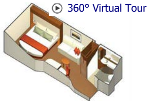
Prime Inside Stateroom from $2663.00