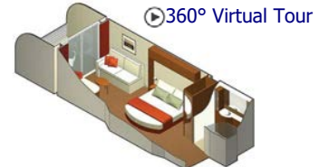
Prime Veranda Stateroom from $3469.00

*Prices are per person, based on double occupancy. ** All Beds separate to two twins.