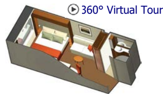
Limited Oceanview Stateroom Upon Request