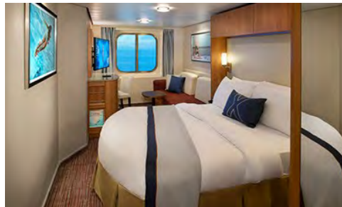
▶ 360° Virtual Tour