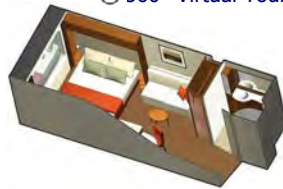
Prime Ocean View Stateroom from $4946.00