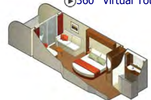
Prime Veranda Stateroom from $4972.00

*Prices are per person, based on double occupancy. ** All Beds separate to two twins.