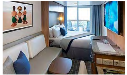
▶ 360° Virtual Tour