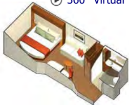
Prime Inside Stateroom from $4399.00