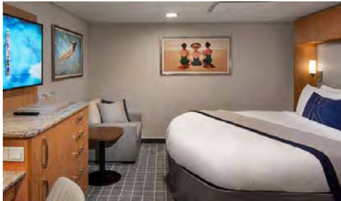
▶ 360° Virtual Tour