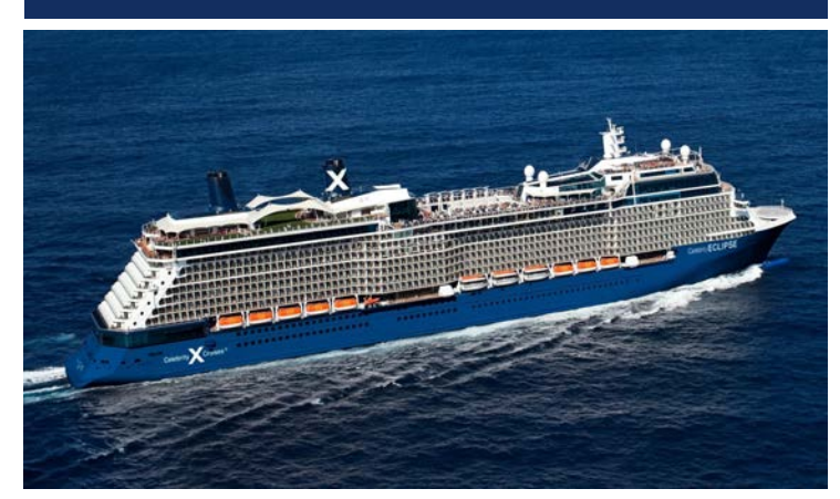
Departing August 3-15, 2025 Celebrity Eclipse 12-Night British Isles Cruise