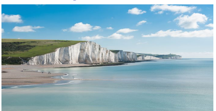
Join the Fabric Patch on Their Inaugural to the Islands of the North Atlantic!