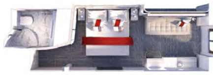
Ocean View Stateroom from $4799.00 pp* *double occupancy