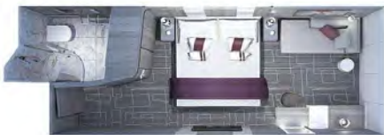
Inside Stateroom from $4599.00 pp*